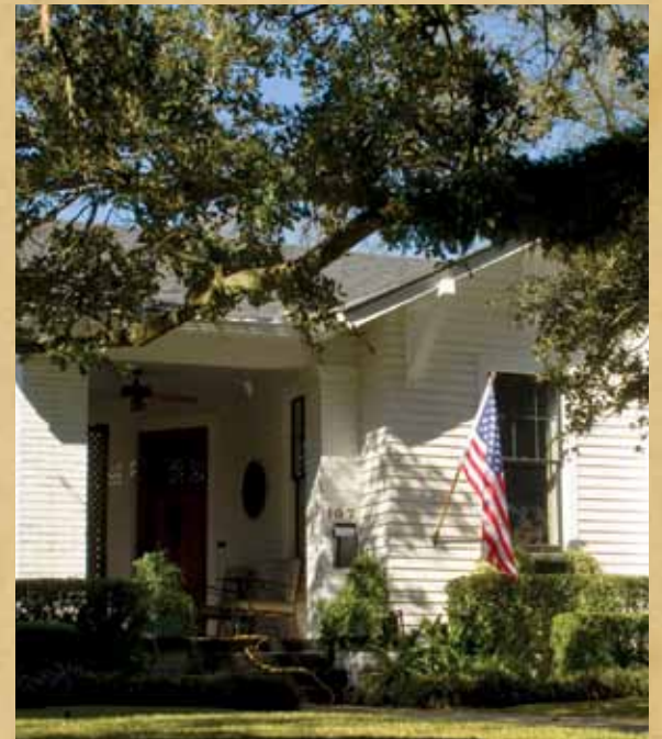
107 Ryan Avenue