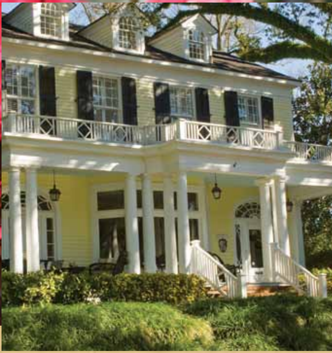
2254 DeLeon Avenue