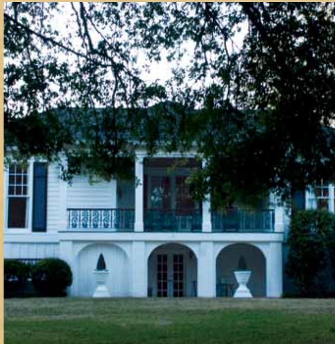
207 Levert Avenue