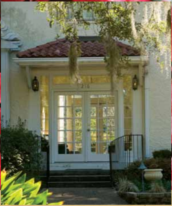
216 Levert Avenue