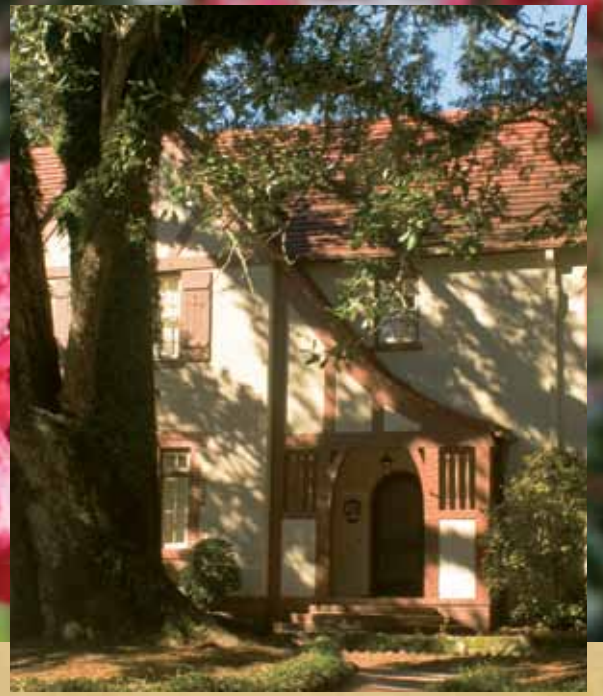
211 Levert Avenue