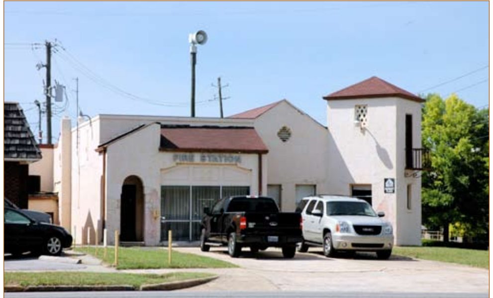
Birmingham's Fire Station #22 on Clairmont Avenue recently faced the danger of demolition preservationists banded together to ensure the building's future as an historic landmark.

"The Trust is very excited about the possibilities for a group like 'I Believe in Birmingham' and applaud them for their efforts to date. We look forward to partnering with them in the future," said Alabama Trust Executive