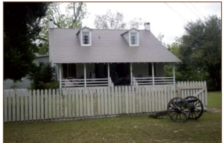
Magee Farm

Located just north of Mobile in the town of Kushla, this Creole cottage style farmhouse built by Jacob Magee in 1848 is one of three major sites associated with the surrender of the Confederate Army, and the only one that retains its original building, in its original, unreconstructed form, with many of the original furnishings intact. Despite the intervention of the Civil War Preservation Trust in 2004, efforts to operate the site as a museum were discontinued in 2010. The site illustrates not only the difficulties faced by many historic house museums in the wake of the economic downturn, but also of the failure of community leadership to recognize and respond to the rare opportunity to keep this nationally significant piece of Alabama history in the public realm.