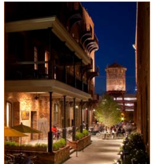
Montgomery's restored Alley Bar

For information about how to participate as a sponsor of the conference, contact the Alabama Trust for Historic Preservation call 205-652-3497 or email alabamatrust@uwa.edu .