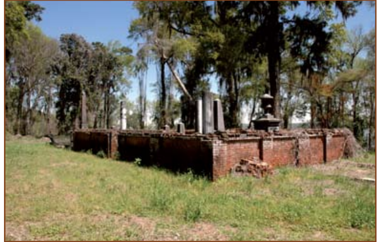
Shorter Cemetery

Situated on a high bluff overlooking Lake Eufaula sheltered by the moss-draped limbs of tall oak trees, the Shorter Cemetery sits on a five-acre plot in the middle of downtown Eufaula. Listed in the National Register of Historic Places, the Shorter Cemetery is the burial place of Barbour County's prominent Shorter family, whose descendants guided Alabama during our most challenging periods. John Gill Shorter, Alabama's first Civil War governor, rose to political prominence during the 1850s, when Shorter emerged as a fierce defender of slavery and advocate of economic development and diversification in support of southern nationalism. In the 1890s, Reuben F. Kolb, nephew of Governor Shorter and grandson of Reuben C. Shorter, patriarch of the Shorter family, rose to political power as an agrarian reformer. Denied the democratic nomination for governor in 1890, Kolb ran again in 1892 and as a Populist candidate in 1894 on a platform to expand the political power of blacks and poor whites.