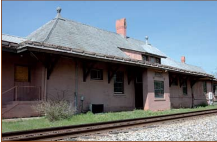
Auburn Train Depot

A central hub of life at Auburn University for more than one hundred years, the Auburn Train Depot was the principle means by which students traveled to attend the university. The building and its surroundings were often the first glimpse new arrivals had of “the loveliest village on the plains” until the last passenger ticket was sold in 1970.