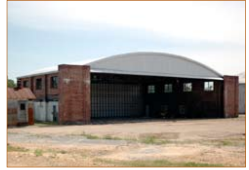
W.P.A. Hangar, Gragg-Wade Field, Clanton, Chilton County; Note that the hangar doors are yet to be installed.