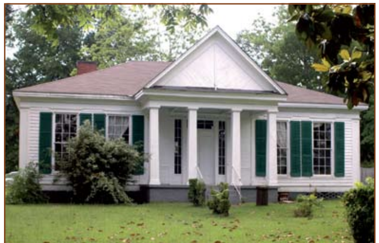
Kelly - Stone - Hill House, Carrollton

This site is threatened by vandals, who have twice damaged the historic cemetery. Additionally, there is an urgent need to repair tombstones, statuary, brick walls, and wrought iron fencing.