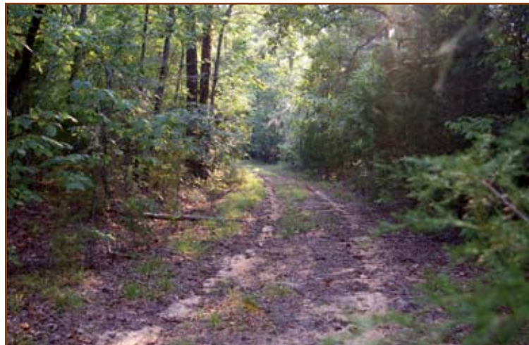
Scene along The Federal Road

The Federal Road became the transportation route for hundreds of thousands of settlers who poured into the newly organized Mississippi and Louisiana territories. With its boundaries greatly expanded by lands acquired from Britain and France, the United States government moved quickly to create a viable transportation network that could connect together the vast lands of the United States. Believing a road between Washington, D.C., and New Orleans to be an 'indispensable necessity,' President Thomas Jefferson in 1805 secured from the Creek Nation transportation rights to a 'horse path' that ran through the southern portion of the Mississippi territory, from the Ocmulgee River in Georgia to Mim's Ferry on the Alabama then up to St. Stephens, Alabama. In 1807, the road was extended from St. Stephens to the territorial capital at Natchez.