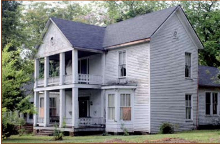
Bankhead-Shackelford House

Courtland, Lawrence County, circa 1880-1900