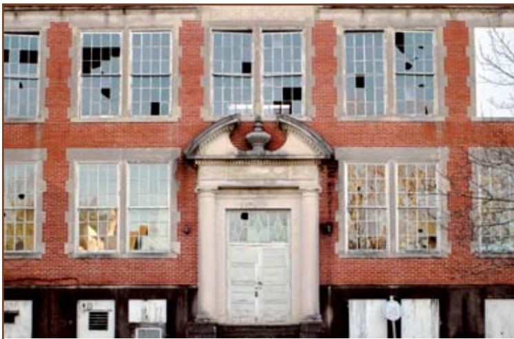
Tremont School, Selma, Alabama Trust for Historic Preservation photo

Historic wood windows are under attack. Massive marketing efforts by window manufacturers, the home remodeling industry, major home improvement retailers, and popular magazines have convinced many that historic wood windows are obsolete and must be replaced for energy conservation and environmental reasons. Nothing could be further from the truth. Studies have shown that retaining and repairing historic wood windows is not only more cost effective, but is also the greenest approach. We join the National Trust for Historic Preservation in proclaiming "Historic windows are disappearing at an alarming rate, and we in the preservation movement have had enough with the onslaught of misinformation about window replacement!"