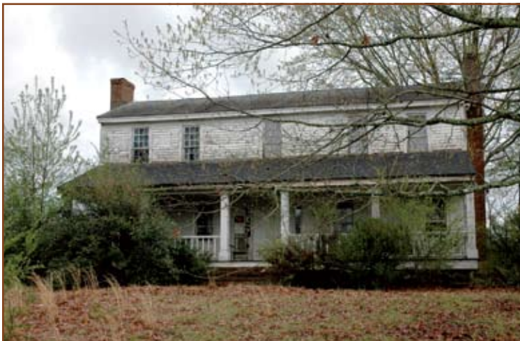
The Bankhead House, Sulligent, Alabama

In the meantime, the depot sits vacant, susceptible to the elements and vandals. It represents one of the prime historic rehabilitation opportunities in Auburn.