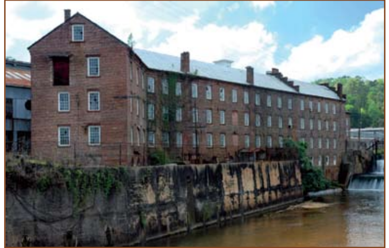
Pratt Mill Complex, Prattville, Alabama Trust for Historic Preservation photo

They frequently stand empty. Large, multi-storied brick buildings situated on the periphery of cities, towns, and villages that are a reminder of a time when Alabama's fortunes were tied to the profitability of cotton. Although a few cotton mills operated in the state prior to the Civil War, the industry boomed during the 1880s. Following World War II, there were periods when the textile industry provided jobs for one in five employed persons in the state. Alabama's textile industry came to a rather abrupt end during the 1990s, when a combination of overseas labor and obsolete machinery shifted the operation of mills to overseas locations.