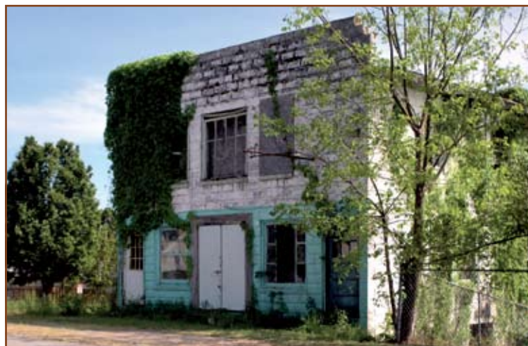
Coosa Co. Farmer's & Civic Assoc., Alabama Trust for Historic Preservation photo

Significant historic elements of the road, often along with their associated settings, survive in varying states of preservation. These resources are threatened by a general lack of public awareness and appreciation. This conspires with inadequate documentation to prevent them from being adequately recognized, protected, or included in community and infrastructure planning efforts.