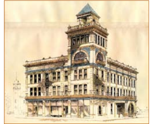
Architect's Rendering, Anniston City Land Company, Chisholm & Green, 1889