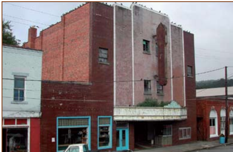
Cricket Theatre

"It's a Wonderful Life," "The Big Sleep," and "The Best Years of Our Life" were among the top movies of 1946, the same year the Cricket Theatre opened in Collinsville. It was also the year credited by film historians as the high-water mark for film going, as more than 80 million people attended the movies every week - almost sixty percent of the total population.